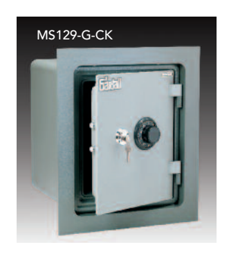
Key required to open safe door. Shelf is not adjustable. EK – push button electronic lock