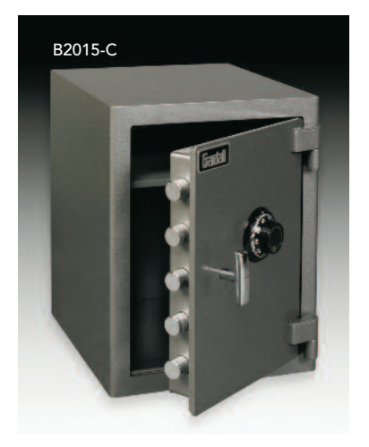
Five massive 1¼" bolts in boltwork