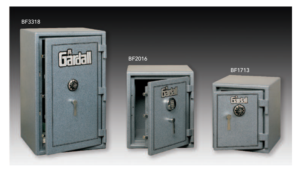
Gardall's GBF models provide both burglary and fire protection for your home or office application. We have been manufacturing fire safes since 1950 and the GBF safe is our premier model in quality and function.

All GBF safes were tested by the manufacturer along side a U.L. listed one-hour fire safe in an independent fire testing facility. The GBF safe actually outperformed the U.L. fire safe by 15 minutes. The exterior of the safe was heated to 1700°F for one hour and during that time the interior temperature of the safe was less than 270°F. A letter of certification is available upon request. All GBF safes carry Gardall's Lifetime Replacement Guarantee.